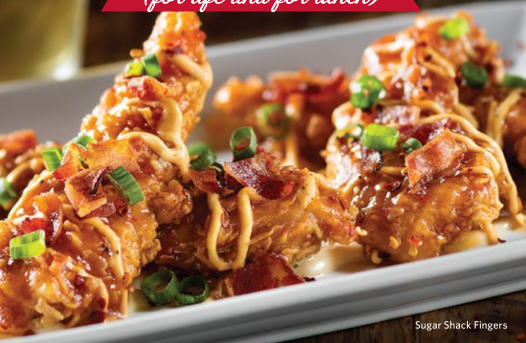
Sugar Shack Fingers