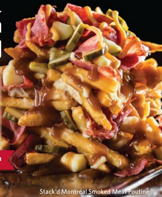
Stack'd Montréal Smoked Meat Poutine

100% Canadian russet fries, cheese curds, gravy, Montréal smoked meat, authentic honey mustard and chopped dill pickles.