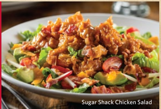
Sugar Shack Chicken Salad

Chopped spicy Sugar Shack Fingers, fresh romaine, bacon, tomato, apple, cheddar, and avocados in an apple vinaigrette.