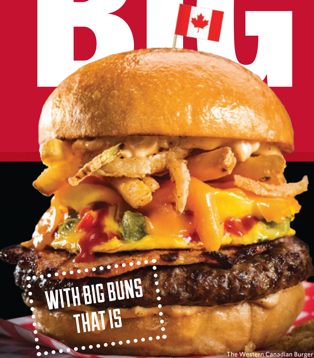
The Western Canadian Burger