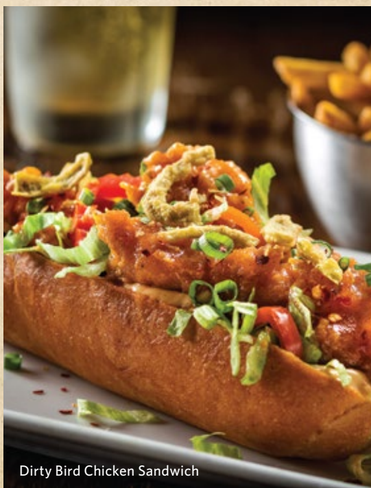
Dirty Bird Chicken Sandwich

Everyone loves a hot mess. We're putting a Canadian twist on things with three tender chicken fingers in spicy maple sauce, chipotle mayo, hot banana peppers, fried jalapeños, green onions and lettuce - all barely contained in an 8 inch egg bun. Will you look dignified eating it? Not likely. Will it be the best thing you put in your mouth today? Absolutely.