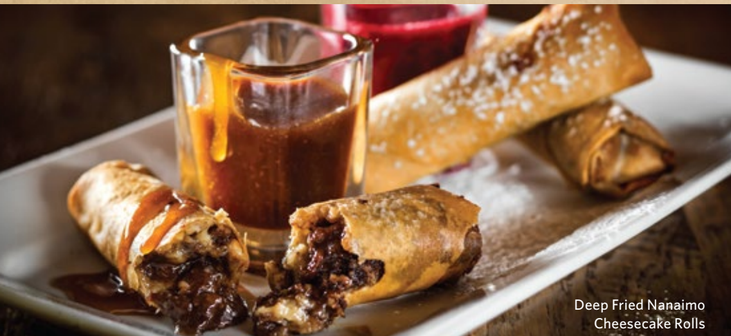
Deep Fried Nanaimo Cheesecake Rolls

Nanaimo bar and rich vanilla cheesecake rolled up in a crispy spring roll wrapper, deep fried and served warm with bumbleberry and caramel sauce for dipping. Word on the street is that it's literally our best dessert ever. Just don't tell our other desserts we said that.